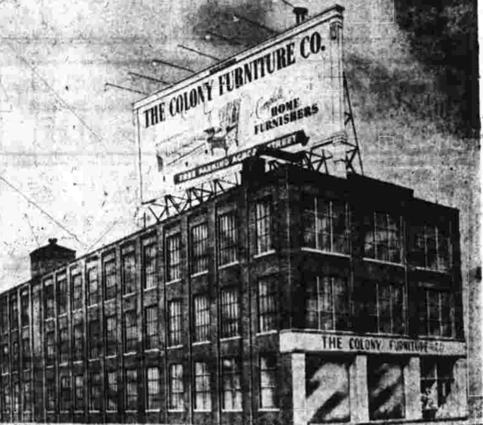
Colony's Retail Showrooms, 776 Conn. Blvd., East Hartford

Closed Monday... Open Tuesday Through Saturday From 9 A. M. to 9 P. M.