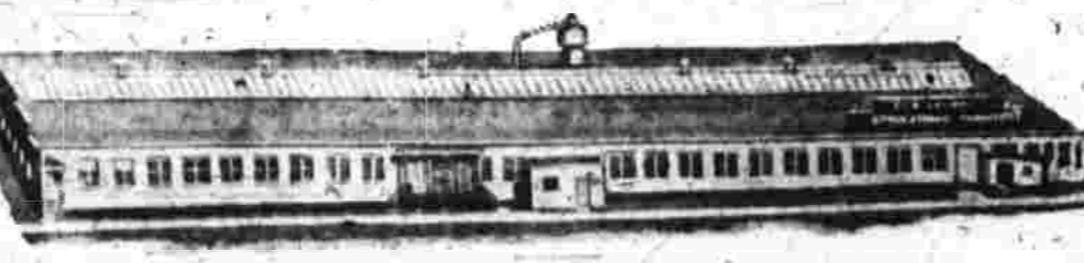
Old Colony Factory, East Glastonbury

This is the combination that makes it possible: We make our own living room suites in our own factory; we sell our own living room suites in our own retail showrooms. We pass the savings on to you... you get good quality at low cost.